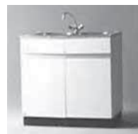
38051 Rental sink unit (Similar model shown)

Please note on the use of commercial dishwashers: